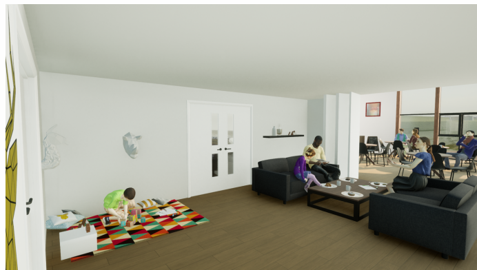
Architect visualisations of the inside of the new Pavilion